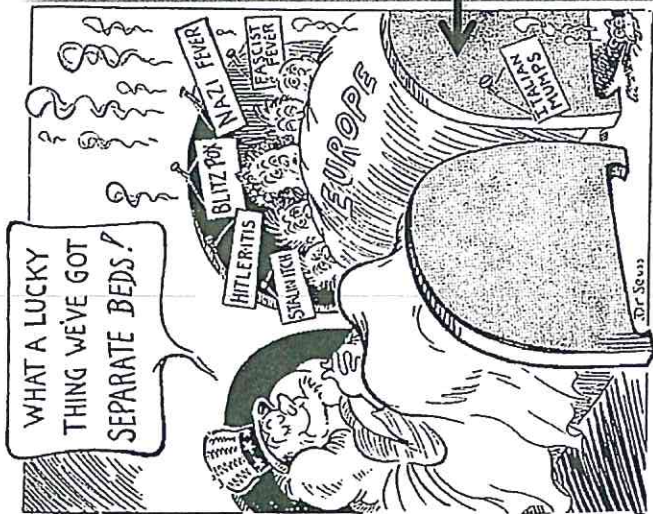
By Dr. Seuss Ho Hum! No chance of contagion.

What was America's stance when WWII broke out in Europe in 1939?